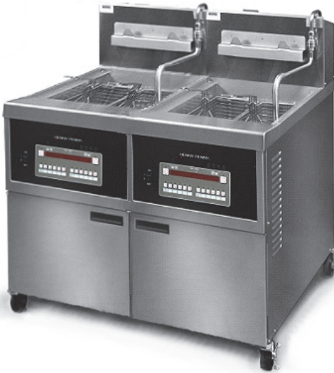
OFG 342 2-well large capacity gas open fryer with Computron™ 8000 control

Henny Penny open fryers offer high-volume frying with programmable operation, oil management functions and fast, easy filtration.