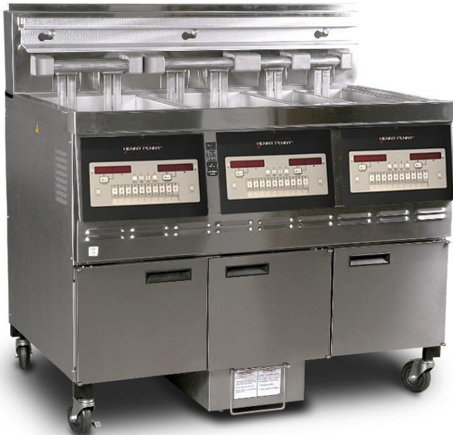
GVE 073 3-well manual low oil volume open fryer with two full vats and one split vat

Henny Penny low oil volume open fryers use innovative design and control technology to significantly reduce frying oil consumption, extend oil life, improve fried product quality and reduce overall oil consumption and costs. Here's how: