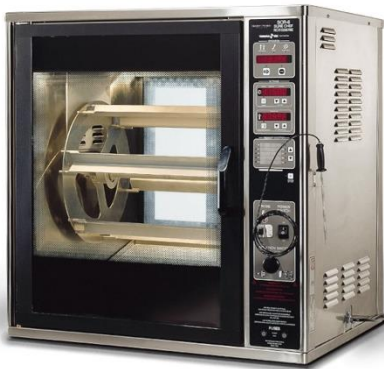
SCR 6 countertop 6-spit rotisserie