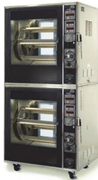
SCR 12 stacked 12-spit rotisserie

The sight, smell and taste of rotisserie chicken can add significant impact and sales to your store. With such a powerful appeal to the senses, choosing your equipment is critical.